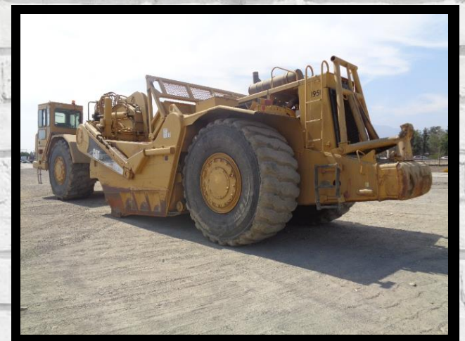
'98 Caterpillar Dozer Sold for $158,625