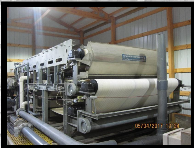
2 Belt presses Sold for $95,625