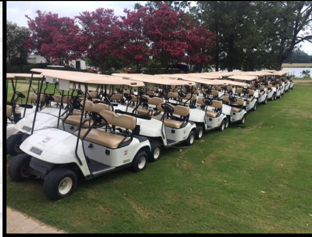
47 2012 Golf Carts