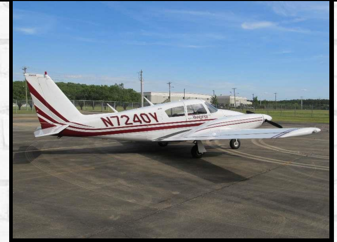
1964 Twin Comanche