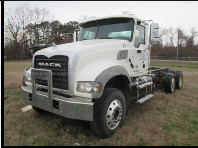
2014 Mack Tractor