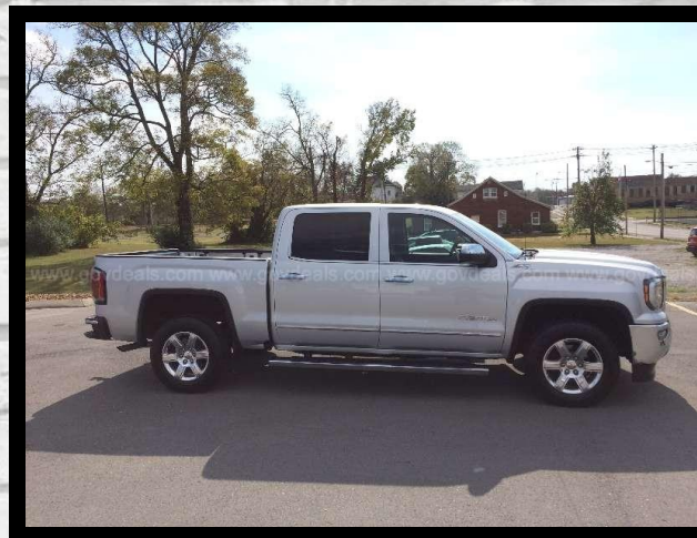
2016 GMC Sierra 1500 Sold for $40,612