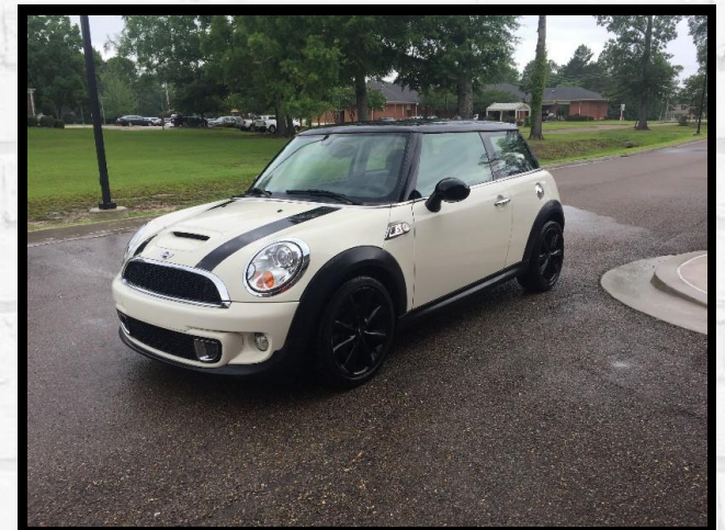
2013 Mini Cooper Sport