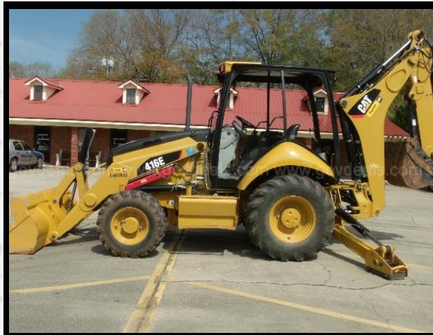
2012 Caterpillar Backhoe