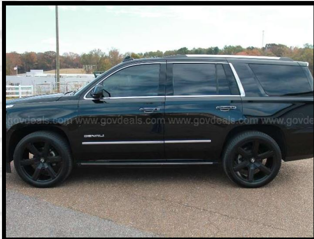
2015 GMC Yukon Denali