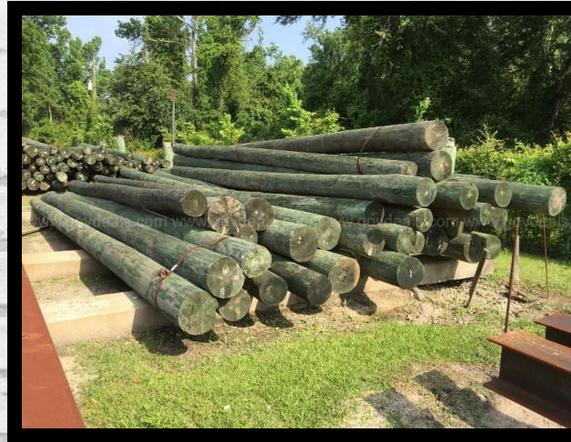
134 CCA Bridge Piles Sold for $10,478