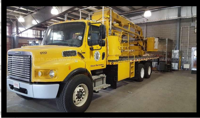
'06 Freightliner Bridge Access Unit Sold for $326,250