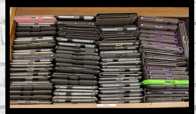
378 iPads Sold for $29,410